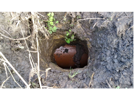
Tile failure: above-clay tile exposed, right-blow holes flagged in field, below: clay tile exposed in blow hole.

or across a property line. Inlets/tile should preferably be installed outside of the road right-of-way. If not possible, get proper